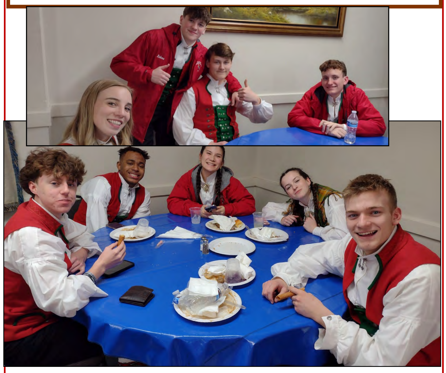
Some of the dancers enjoying the meatball supper at the lodge after the recital.