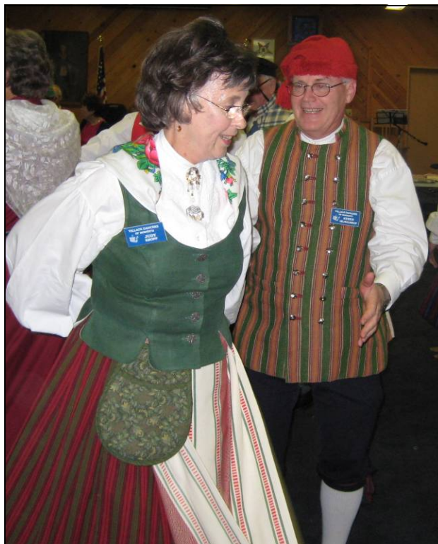
Some of the Viking Dancers of Modesto in action.