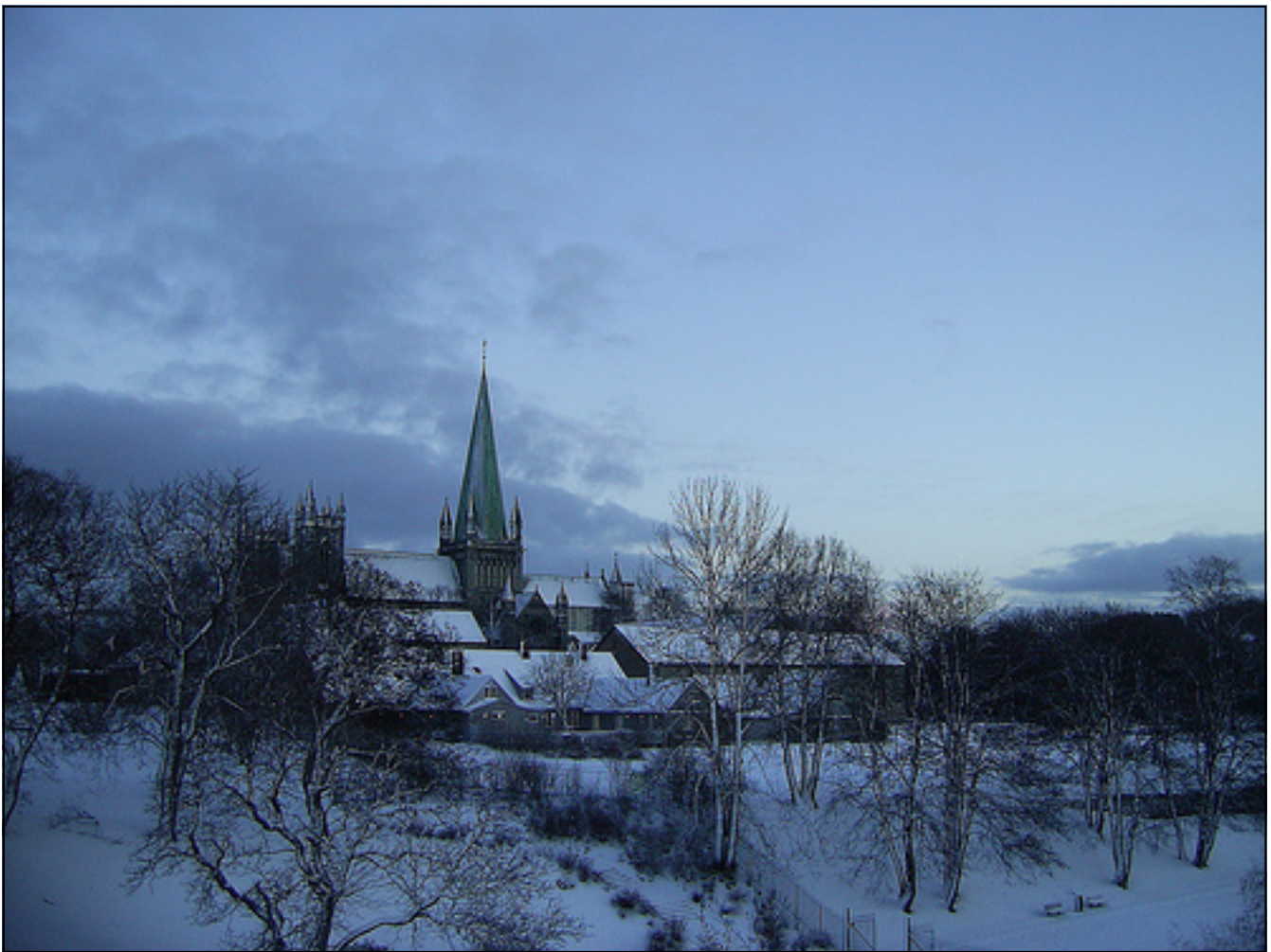
NIDAROS CATHEDRAL, TRONDHEIM

Seasons Greetings from Roald Amundsen officers and Navigator staff.