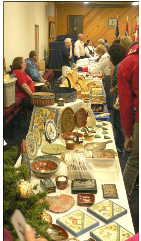
Our lodge vendor line. Denio's has got nothing on us!