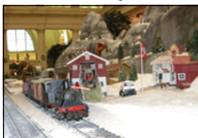
This year's model train.

The tree display is augmented by the Norwegian model train setup, also at Union Station. It will be opened for display in a day or two, and this also marks the regional kick-off for the 2008 U.S. Marine Corps Reserve Toys for Tots campaign. The giant Norwegian