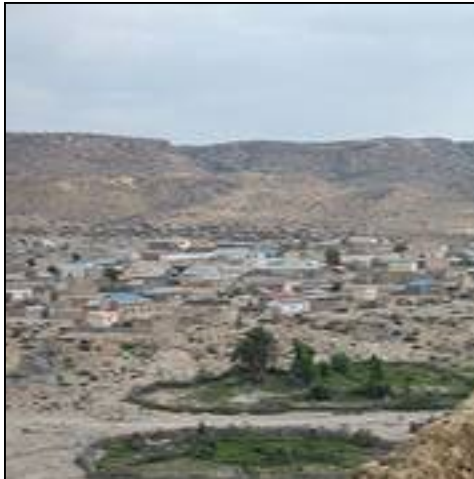
The "Boomtown" of Eyl.