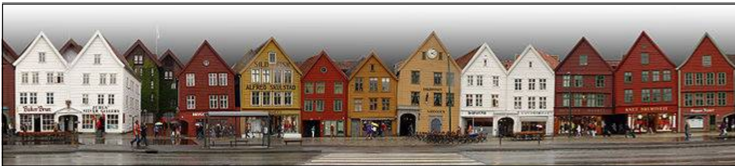
Panorama of the Hanseatic buildings of Bryggen.