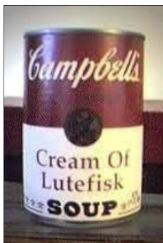
(Reprint from Midnattsolen News, Chico.)

Camp Norge has a $3/day use fee. www.campnorge.com.