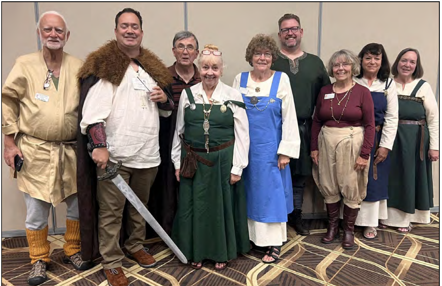
Roald Amundsen Lodge's Viking Delegates at the Convention. The old, gnarly, retired Viking on the left is sporting rudimentary spectacles and holding an old cell phone, both found in a recently excavated Viking grave.

Many items of business were addressed. The major “takeaway” from the convention is that company procedures have been modified and International Directors will now be elected by members who own a Sons of Norway product , and not by the delegates at district conventions. This change brings Sons of Norway into compliance with the way most other insurance companies elect their Boards.