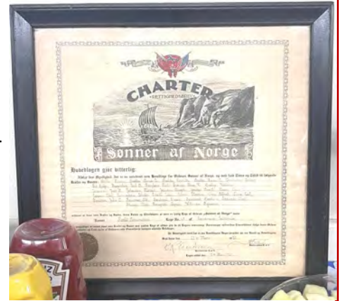
CHARTER FROM 1929. KETCHUP FROM 2015

Over 30 members and guests observed the lodge's 95 th Anniversary on Styttende mai. Interesting Norway history was presented and some members reminisced about the lodge's own history. The 1929 Charter and artifacts from the lodge's past were displayed. There were aquavit toasts to many lodge memories, and as the evening went on there were aquavit toasts to aquavit toasts.