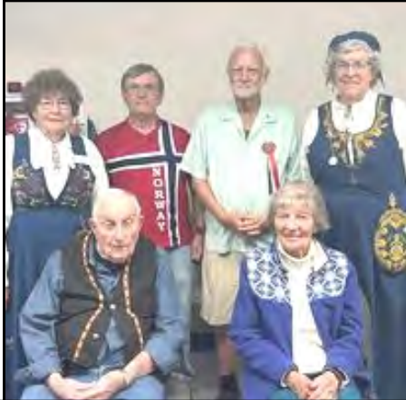
Some lodge presidents, although indeed past, were also present.

Over 30 members and guests observed the lodge's 95 th Anniversary on Styttende mai. Interesting Norway history was presented and some members reminisced about the lodge's own history. The 1929 Charter and artifacts from the lodge's past were displayed. There were aquavit toasts to many lodge memories, and as the evening went on there were aquavit toasts to aquavit toasts.