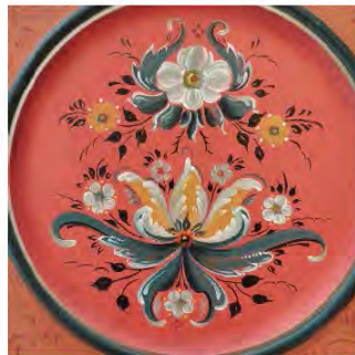
Onya's design: Hallingdal Plate

PROJECT: We will be painting a 12" plate with an 8" center and beaded rim.