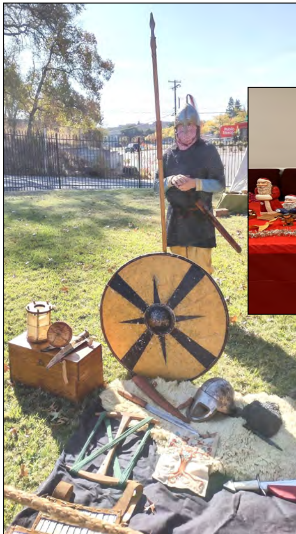
The Viking reenactment group know as Hrøkr Følk demonstrated Viking everyday living on the front lawn of the lodge. Woodcarver’s table (below).