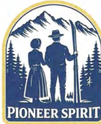
District Six 2026 Convention Sacramento, California